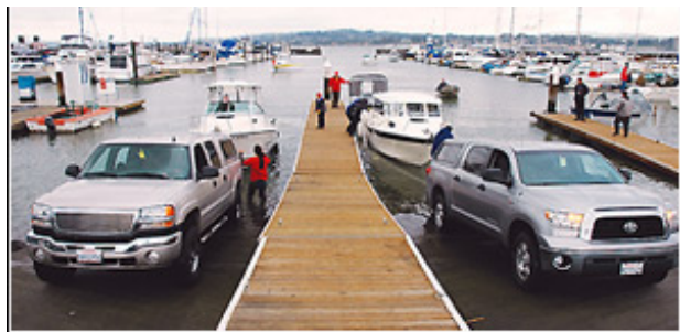
LAUNCH RAMPS at Martinez Marina were crowded in the morning during the initial launch, but everything went orderly and without incident.