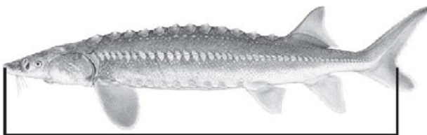
New measurement method (fork length)